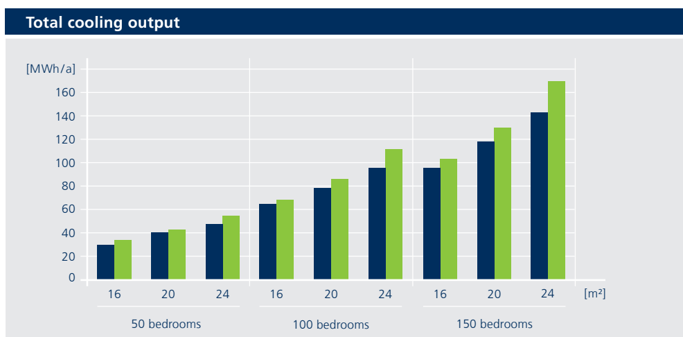
Fig. Comparison of the cooling energy requirement based on the total of the hourly cooling loads multiplied in each case by 20 hours and the number of bedrooms.

The result of the electrical energy requirement in the air handling unit is reflected in the cooling energy requirement. It was assumed that the primary air enters the room pre-conditioned. Greater cooling output from the air handling unit is fed to induction units owing to the increased air volume, regardless of whether the cooling output is actually needed. It is also possible that the outside air is cooled in the centralised ventilation unit and has to be re-heated in the room to the customer's requirement.