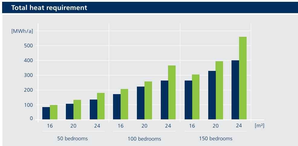
Fig. Comparison of the heating energy requirement based on the total of the hourly heat load multiplied in each case by one hour and the number of bedrooms.

It is not possible to use the recirculating air in a mixing chamber in the centralised ventilation unit, as the extract air from the bathrooms may not re-enter the supply air on account of the odours produced there.